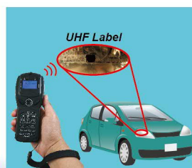
License Plate Management